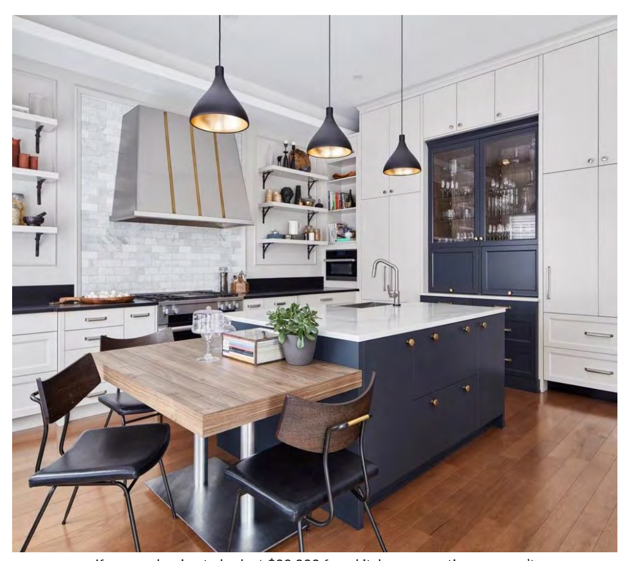
If you are hoping to budget $20,000 for a kitchen renovation, you can't expect to get a kitchen like this Astro Design Centre project, which cost more than $40,000 for the materials alone, never mind the labour.

If you've never dipped your toe into renovations, you may have no idea how much a renovation should cost you. There are a lot of variables and you really won't know until you start getting estimates from renovators, but it's a good lead to have at least a ballpark idea.