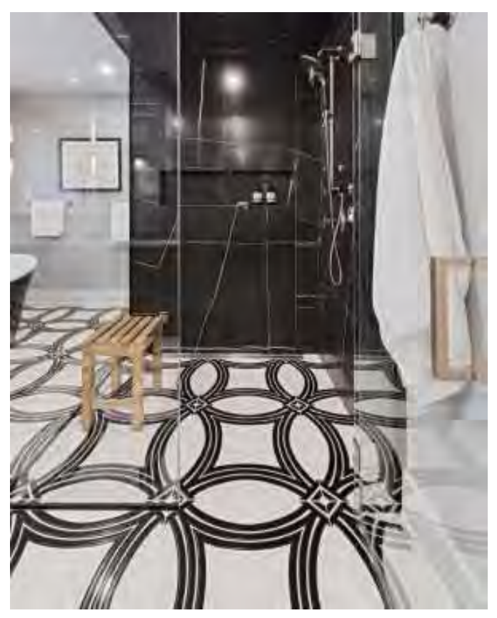
Porcelain slabs are a specialized product that's newer in Ottawa. They're seen in this shower by Amsted Design-Build and StyleHaus Interiors.

And having all of these decisions made ahead of time means there is one less thing to have to remember once construction has begun.